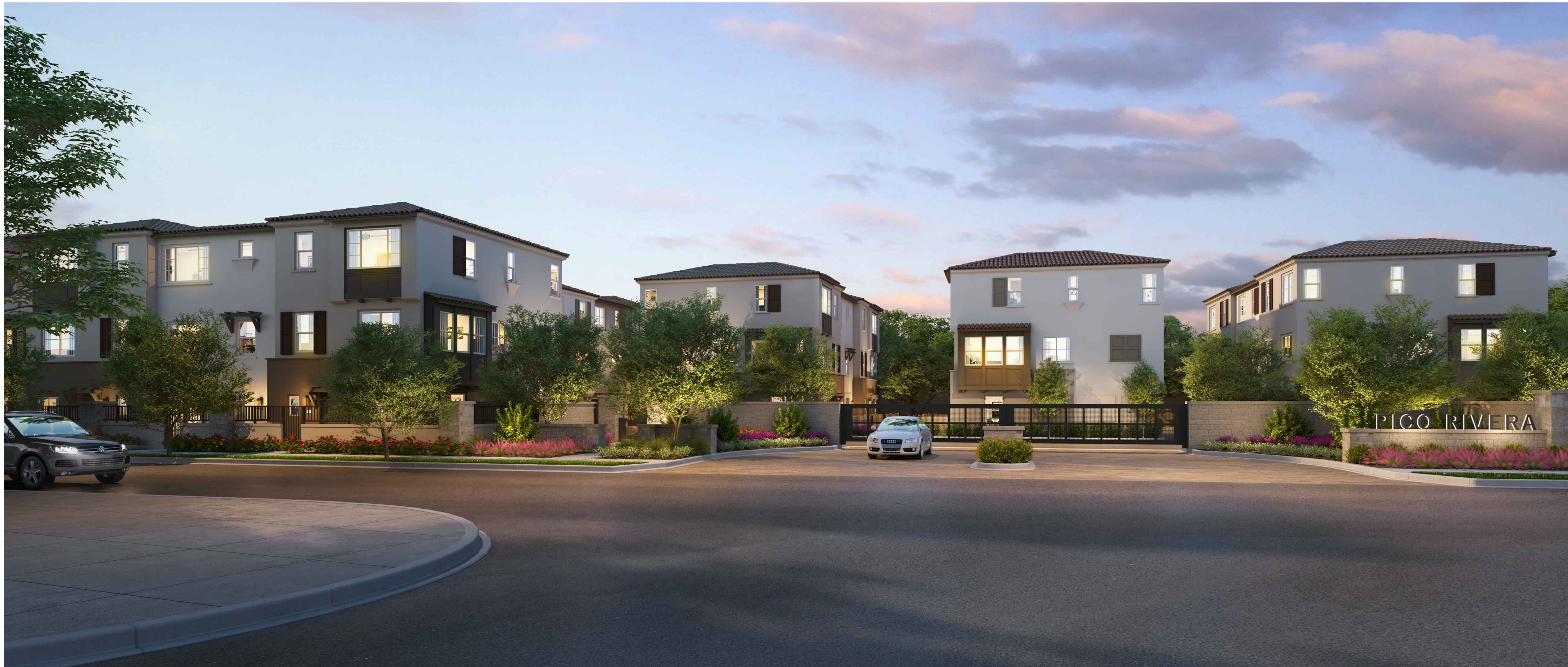
VIEW LOOKING INTO FRONT ENTRY GATE FROM STEPHENS STREET