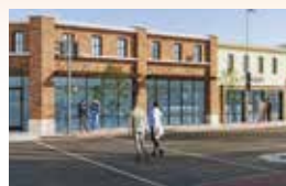
Facade Improvement Program