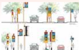
Branding, Signage & Furniture Master Plan

The adopted Multimodal Plan will complement and support other projects, including: