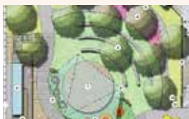
Passons Avenue Depot (PAD) Park