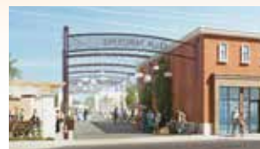
Los Paseos Project: Phase 1