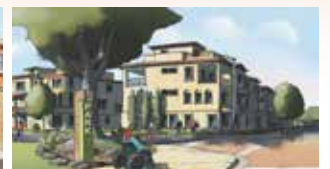
Historic Whittier Boulevard Specific Plan